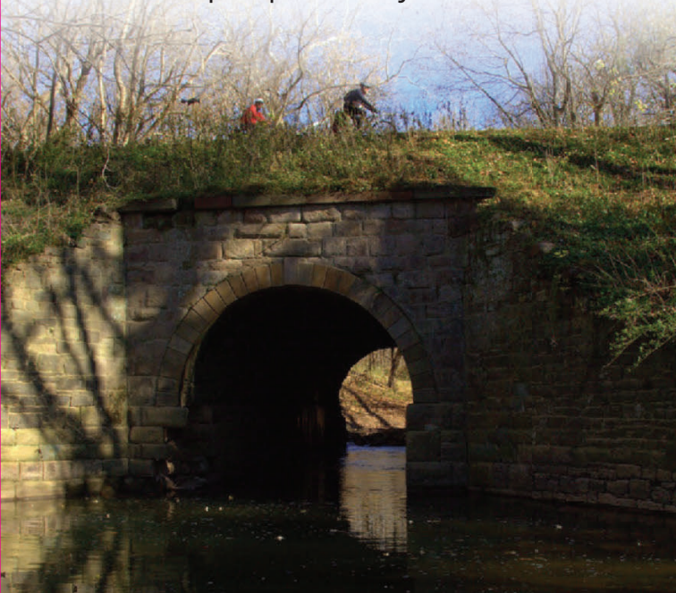
Tuscarora Aqueduct

Sugarloaf Regional Trails (SRT), a 501(c) 3 organization, is dedicated to the conservation of Montgomery County's rural cultural landscape and to the Potomac highland region. Membership is open to everyone.