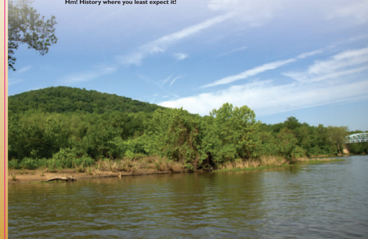
Conoy Island